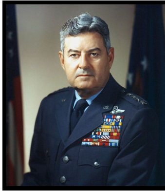
Curtis LeMay

The other leading figure was Gen. Curtis E. LeMay, who capitalized on several factors in his campaign to make air power the predominant instrument of war: a free hand in making tactical and even strategic decisions; technology (a highly sophisticated long-range bomber); geography (bases largely isolated from hostile forces); and unfailing loyal crews (men who flew long missions against exceedingly tough odds).