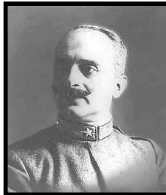
Giulio Douhet

The B-29 operations in the Marianas represent two milestones in the transformation of American air power. First, they marked a necessary departure from both the teachings of the Air Corps Tactical School and the strategy in Europe, which called for precision bombing of enemy military and industrial targets. Instead, the leaders of the B-29 missions put Giulio Douhet’s theories into practice, using area bombings intended to defeat Japan by demoralizing the civilian population.